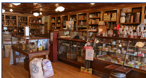
The General Store Gallery in new Cedarburg History Museum

"We are so grateful that the Greater Cedarburg Foundation has helped the