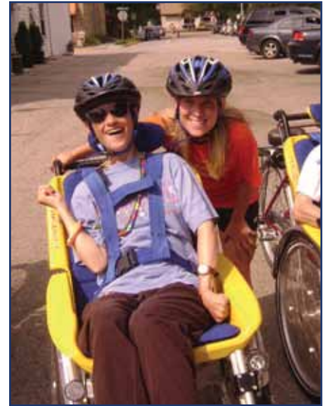
Special Duet bike enables a disabled or elderly person to enjoy a bike ride

The program began in June and four of the bikes are located in Cedarburg