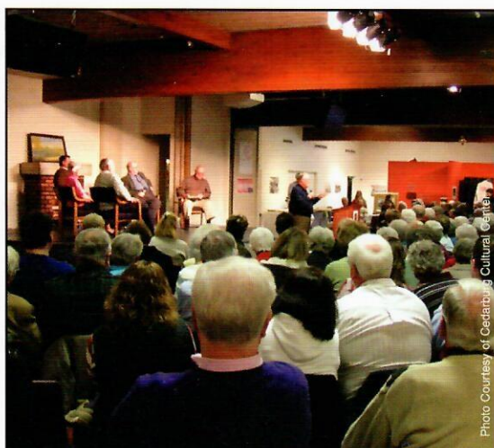
Chat Series at the Cedarburg Cultural Center