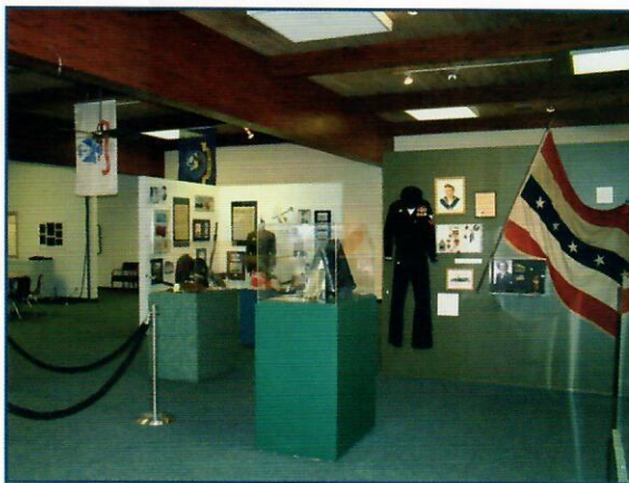
World War II Exhibit, Cedarburg Cultural Center

During 2008, seven organizations received grants from the Foundation, including "Honor Flight" an effort to send World War II veterans to Washington, D.C. to view the WW II War Memorial, the Cedarburg Players, Cedarburg Cultural